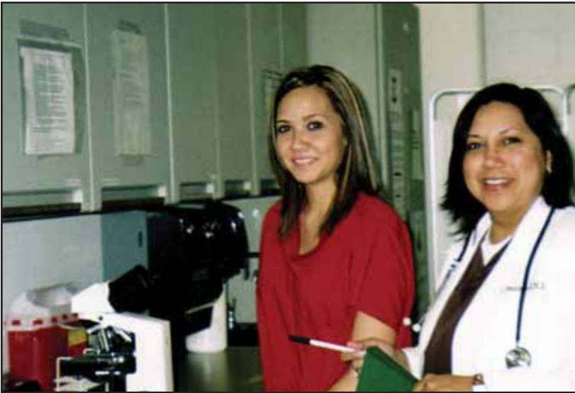
Photo taken ACI-Medical Lab

Any dispute arising from enrollment at Arlington Career Institute, no matter how described, pleaded, or styled, shall be resolved by binding arbitration under the Federal Arbitration Act conducted by the American Arbitration Association (“AAA”) at Dallas, Texas, under its Commercial Rules. All determinations as to the scope, enforceability, and effect of this Arbitration Agreement shall be determined by the Arbitrator, and not by a court. The award rendered by the Arbitrator may be entered in any court having jurisdiction.