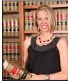
THE DEMAND FOR PARALEGALS IS GROWING.

Some of these subjects will be offered via distance education.